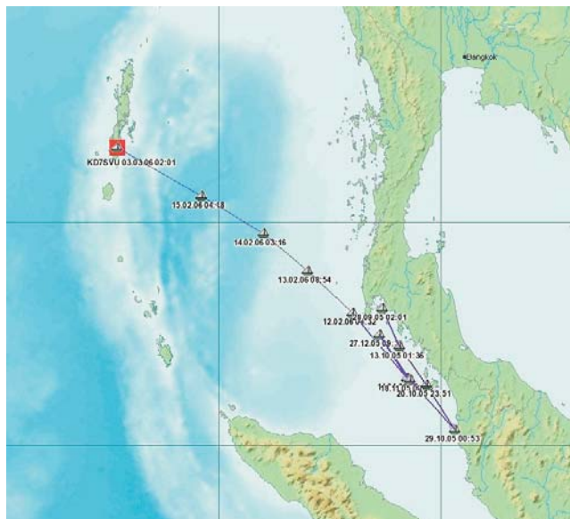
Tracking: SV IRON LADY, KD7SVU, is showing her current position on the internet, with data-based former positions also being visualized.